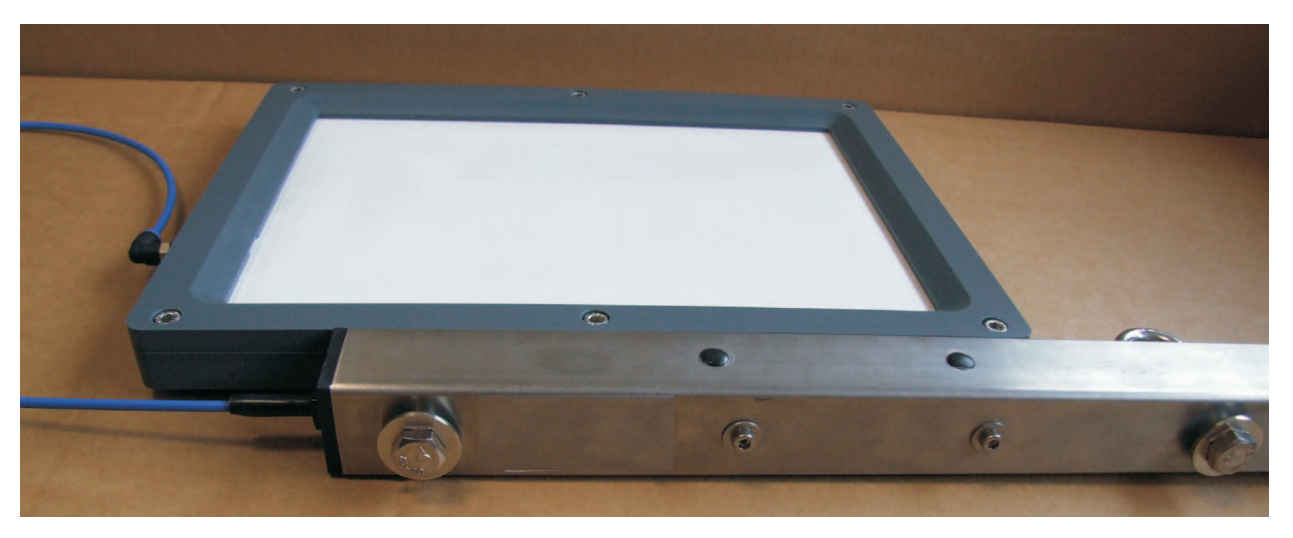
Figure 2 Installation of the filter membrane module on the slide