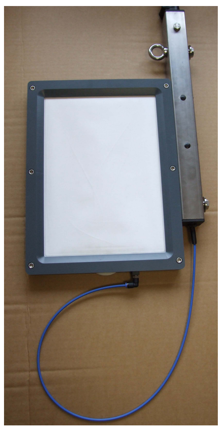
Figure 3 Filtration unit

4 Continue as described in operating manual P 700 IQ, chapter COMMISSIONING.